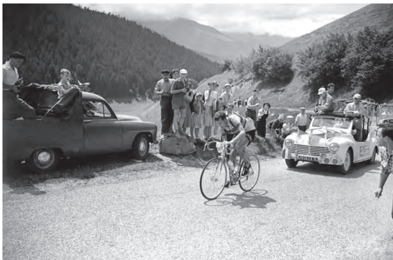
Louison Bobet during the 1955 Tour de France

Saint-Gaudens is one of the Pyrenean cities whose name rings a bell with cycling fans. Some of the greatest mountain stages in the Tour's history finished there, such as in 1955, when Louison Bobet put on the yellow jersey and kept it on for the rest of the race, allowing him to become the first man to win three Tours de France in a row. It was also after the start in Saint-Gaudens in 1976 that Joop Zoetemelk was relegated by Lucien Van Impe by more than 3 minutes and the latter took a firm option in Saint-Lary-Soulan on the overall victory.