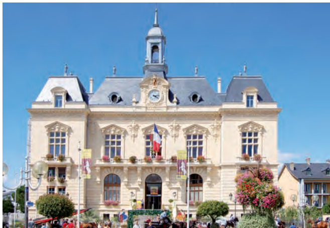
Town Hall

The PAMELA Project (Process for Advanced Management of End-of-Life of Aircraft), which involves the dismantling and recycling of aircraft, provides an opportunity to give a new boost to the economy of Tarbes. For several years, the chamber of commerce and industry analysed opportunities for creating an industrial aeronautics site around Tarbes-Lourdes International Airport. With its long runway which allows all kinds of aircraft