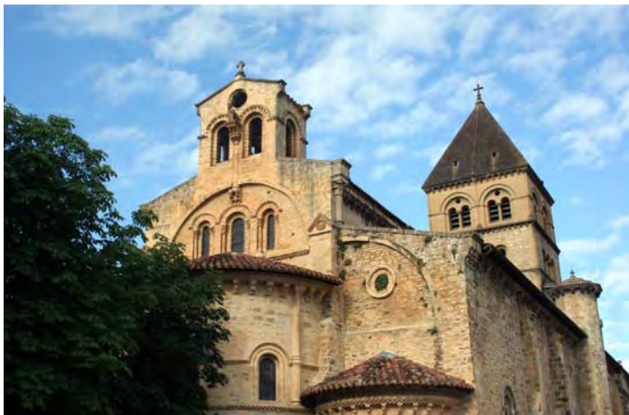
The collegiate church of Saint-Gaudens

30 August 1661 is one of the important dates in Saint-Gauden's history, as the remains of the saint who gave his name to the town were returned to the collegiate church on that day. They had been previously moved to protect them from being pillaged and destroyed during the wars. 29 September 1997 could have become a date which was celebrated by the inhabitants of Saint-Gaudens: on this day two priceless Aubusson tapestries, which had been stolen by daring burglars seven years earlier, were returned to the same collegiate church. "The Triumph of Faith", a copy of one of Rubens' paintings and the "Martyrdom of Saint-Gaudens", which recounts the legend of the saint beheaded by the Visigoths, disappeared sometime during the night of 20 December 1989. The tapestries, which were made around 1760 by the Royal of Factory of Aubusson, only reappeared seven years later during an auction in New York at Sotheby's. It was an archivist from Aubusson who recognized the stolen works when he looked at the sales catalogue out of curiosity.