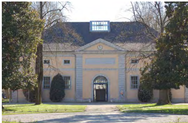
The National Stud

However, it was because of the Hussars, who turned Tarbes into a garrison town, that the National Stud was created in 1806 by imperial decree. It was used for many years to supply horses to the army's most eminent riders. Tarbes was one of the few studs to have been visited by the Emperor, two years after it was built in 1808. It is set in magnificent grounds covering nine hectares, and today represents a harmonious and remarkable Empire-style architectural grouping, which is a blend of sober and classical beauty. Following major renovation work that was carried out in 1995, a "Maison du Cheval" was created which houses a museum dedicated to the life and the image of horses in the region. In addition to traditional activities, the National Stud of Tarbes hosts the Equestria Festival each year and organises events focusing on the southern breeds and equestrian techniques. However, the stud's most won-