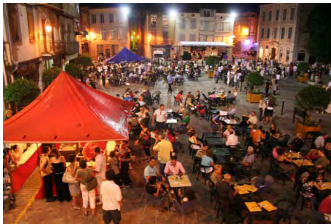
The dynamism of the town centre of Saint-Gaudens

But there are still traces of the circuit in the town: the Azémar public garden bears the name of the founder of the circuit and the Boulevard Wimille, the Rue Etancelin or the Avenue René Dreyfus, named after the driver who miraculously survived an accident on the circuit, pay tribute to the drivers of the period. Since 1985, the "Ecurie Automobile du Comminges" has organised retrospectives which are very popular with the public. This is how the idea of creating a museum was born and the initiative is supported by the "Communauté des communes" (federation of municipalities) of Saint-Gaudin.